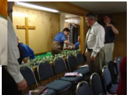
Men Students Practicing Baptism