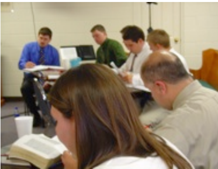
Baptist History Module

Section 13: Abortion - We believe that human life begins at conception and that the unborn child is a living human being. Abortion constitutes the unjustified, unexcused taking of unborn human life. Abortion is murder. We reject any teaching that abortion of pregnancies due to rape, incest, birth defects, gender selection, birth or population control, or the mental well-being of the mother are acceptable (Job 3:16; Psalm 51:5; 139:14-16; Isa. 44:24; 29:1,5; Jer. 1:5; 20:15-18; Luke 1:44).