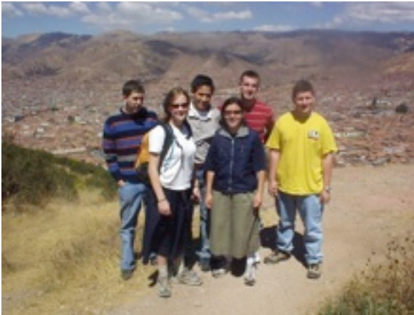
Students in La Paz, Bolivia During Missions Internship

The internship program will be served in a local church, under an approved veteran pastor. The student will be assigned tasks and given instruction by the local church pastor. Each day will be filled with diligent study and practical service, and the student will be exposed to real-life applications of ministry.